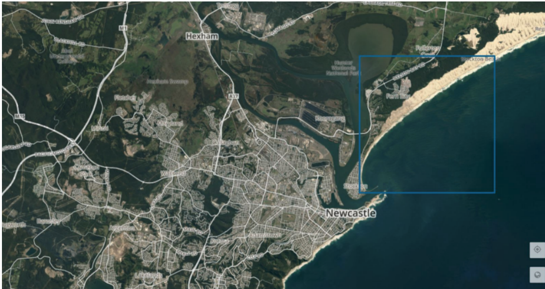
Single Quad within a basemap