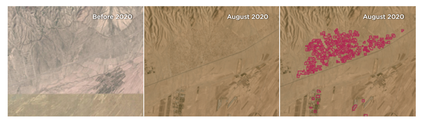
New city next to Herat, Afghanistan

Defense & Intelligence: Update your base layers every month