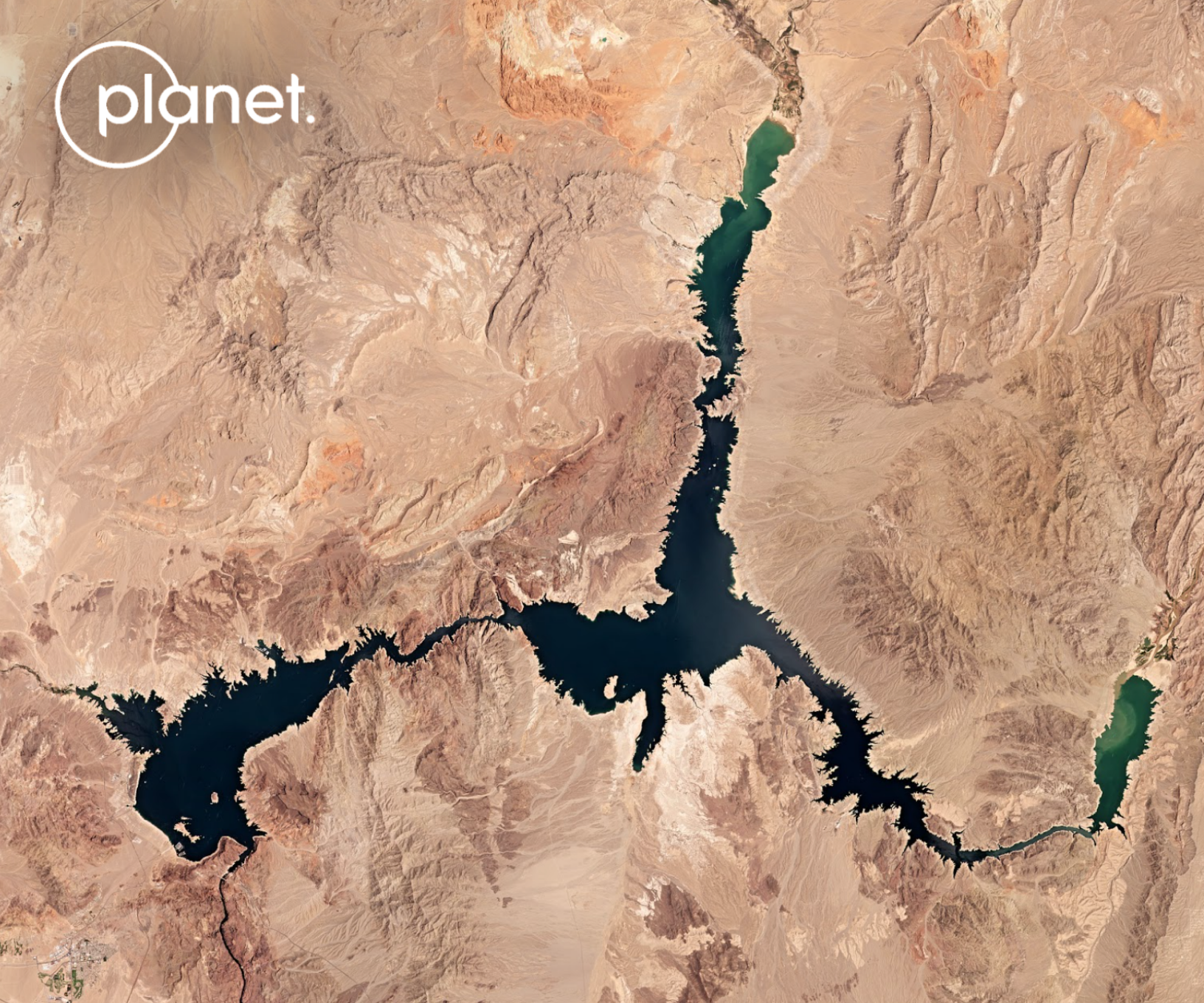
Lake Mead United States